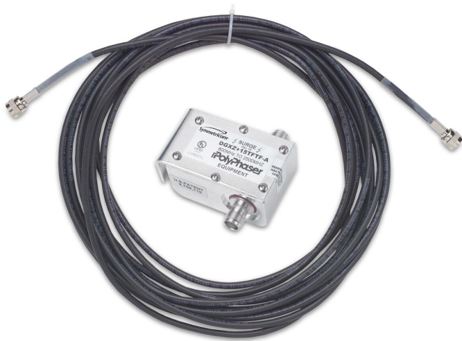
Lightning Arrester Kit (shown with 25' cable)